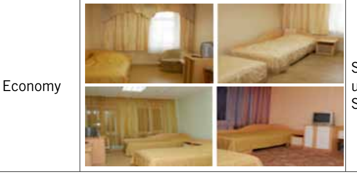
Studio: 1-4 90*190 beds, a drawer unit, TV, a wardrobe, a fridge. Shared shower, WC: on the floor.

Hotel "Omskaya" offers rooms of different categories.