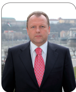
Marius L. VIZER IJF President

The IJF World Judo Tour is set for South Korea and the Judo Grand Prix, Jeju 2014.