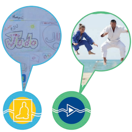
Poster Exhibition , Photo Contest "Judo in Action" 2nd European Science of Judo Research Symposium 2015