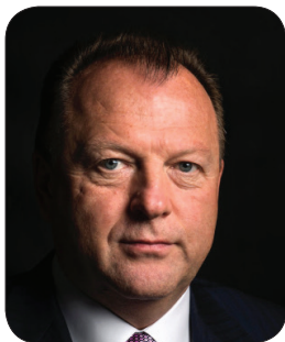
Marius L. VIZER IJF President

It is a real pleasure for the International Judo Federation, to welcome the judo family to Rabat, Morocco, in North Africa on the occasion of the World Judo Masters - Mohammed VI - 2015.